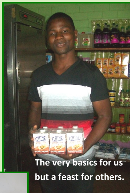
The very basics for us but a feast for others.