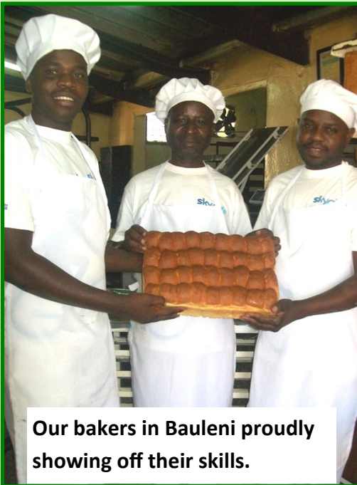
Our bakers in Bauleni proudly showing off their skills.

We prepared 2 boiled eggs, two bread buns and a drink for each. The bread buns we bought at Bauleni Special Needs Project as the bread there sure is next to none in quality and we knew they would enjoy the lovely fresh buns.